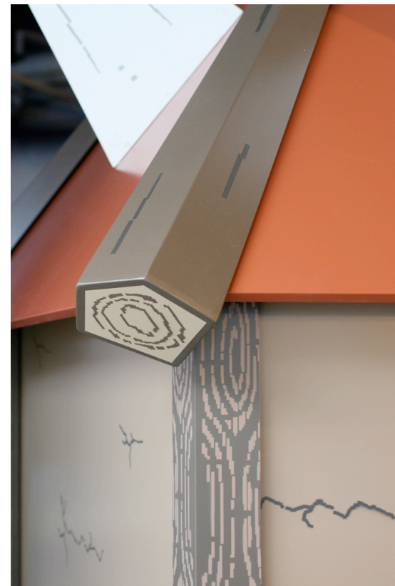
figure 2. Details.

The exterior of WoW Pod mimics the look of WoW architectural structures, whose swaths of flat, pixellated surfaces digitally recreate the built environment of an imagined past. Upon crossing the threshold and entering WoW Pod, the player finds a tangible simulation of things digital.