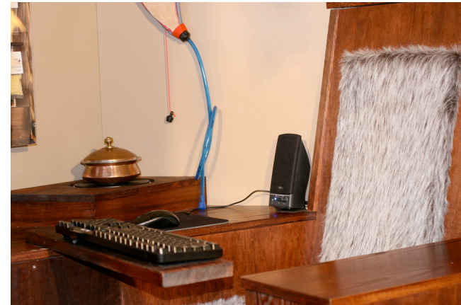
figure 5. Inside the WOW Pod.

fatigued. Fear not, Warrior — the WoW Pod provides all things to sustain your health. Thirsty? Quench your thirst with refreshing spring water located in the leather bag to your right. Hungry? Grab a packet of food located on the wall to your right. Pass the package directly under the red light. Pour the contents of the pouch into the pot on the stovetop along with 1.5 cups of refreshing spring water. The WoW Pod will control the temperature and time needed to cook your meal. Cooking time varies according to the meal you've selected. Your avatar will alert you when your meal is ready and immediately place your computer into AFK ('Away From Keyboard') mode. Take this time to nourish yourself — many more challenges await you. Need to use the restroom? Flip the seat of your throne and discover the necessary facilities."