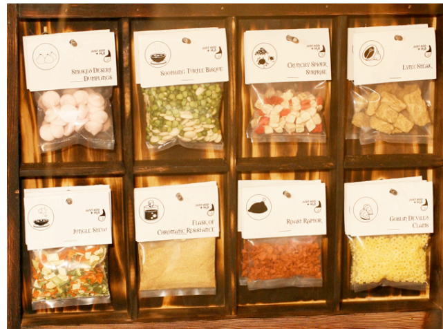
figure 3. Food items.

When hungry, the player selects a food item and scans it in. WOW Pod then physically adjusts a hot plate to cook the item for the correct amount of time and temperature.