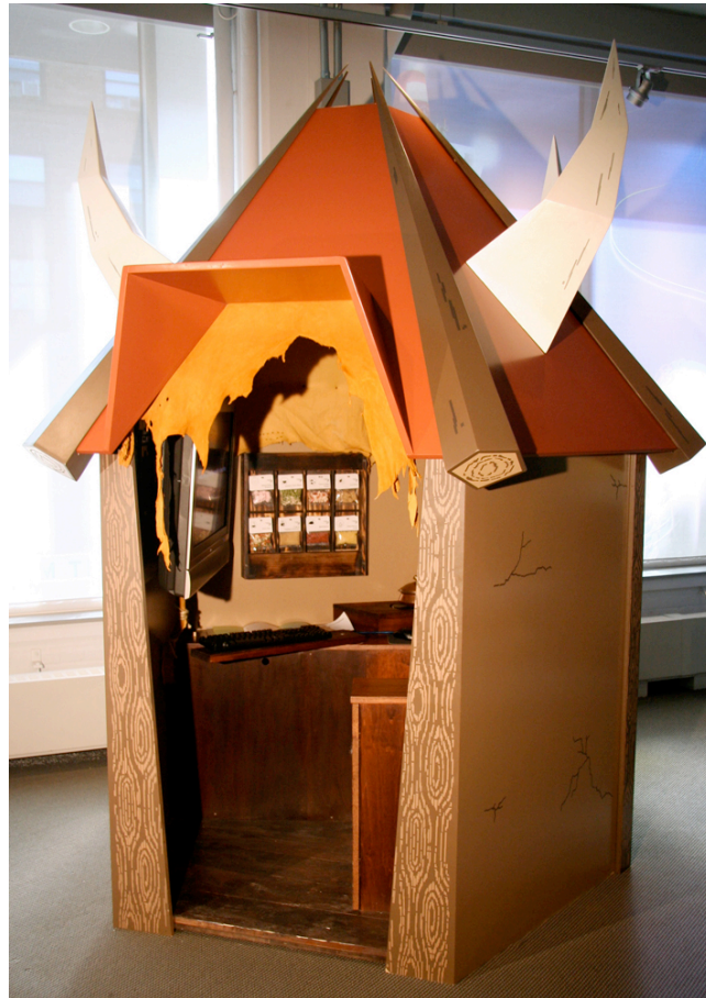
figure 1. WoW Pod.

Inside, the player finds him/herself comfortably seated in front of the computer screen with easy-to-reach water, pre-packaged food, and a toilet conveniently placed underneath a built-in throne.